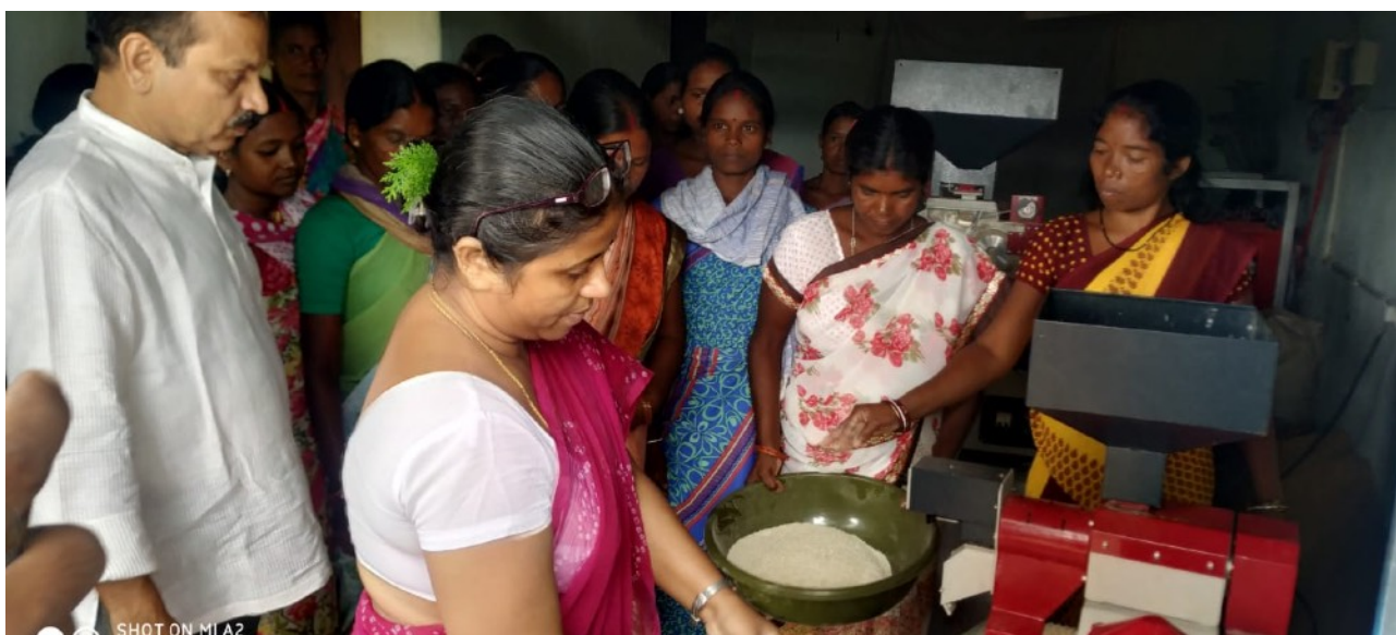
Photo taken in 2019, during the inauguration of the Decentralized Solar Powered Rice Mill