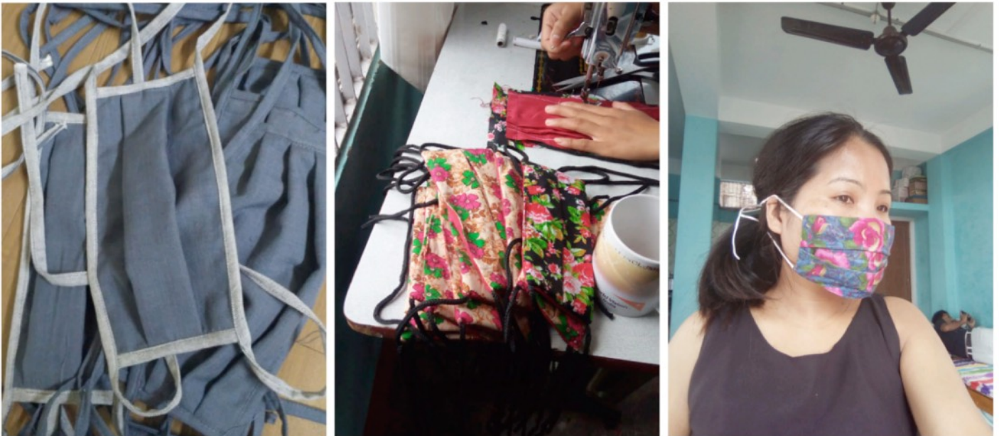
Masks in production at the Priscilla Centre