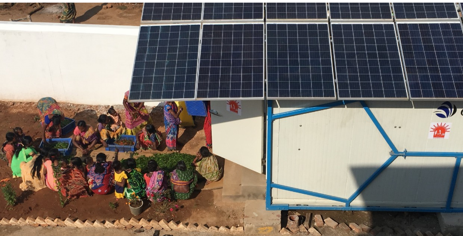
Cold Storage Facility at the Markoma Women Farmer Producer company (The picture was taken before the Lockdown and the COVID19 Pandemic)