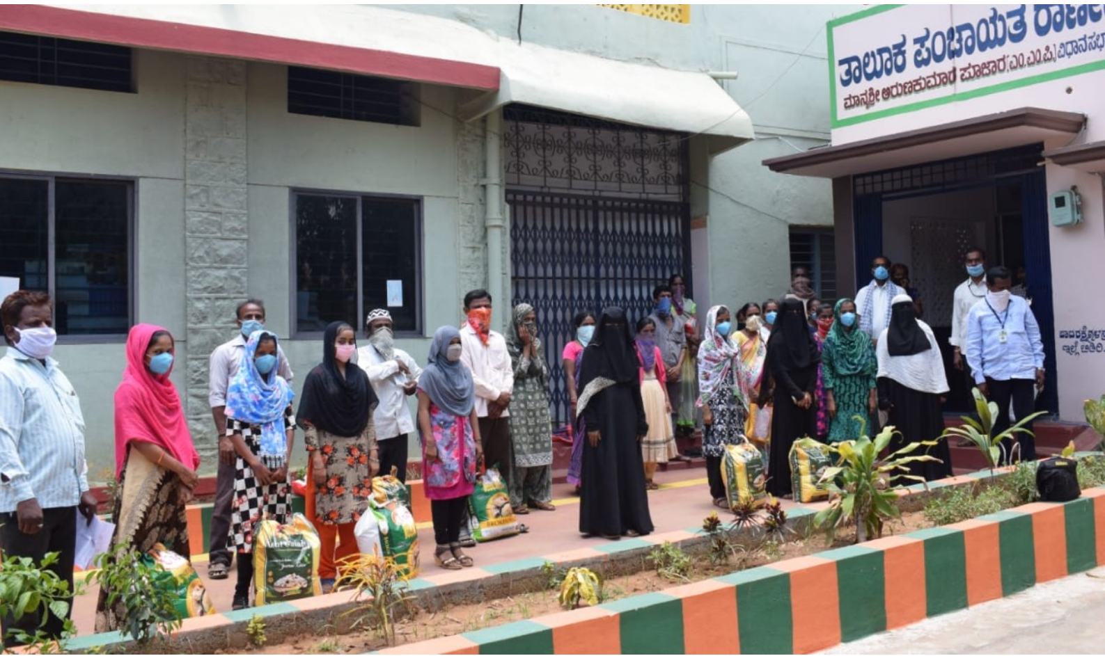
Vanasiri Rural Development Society Ranabennur, distribute groceries as a relief package along with the Tahashildar, Executive officer, Asst Director.