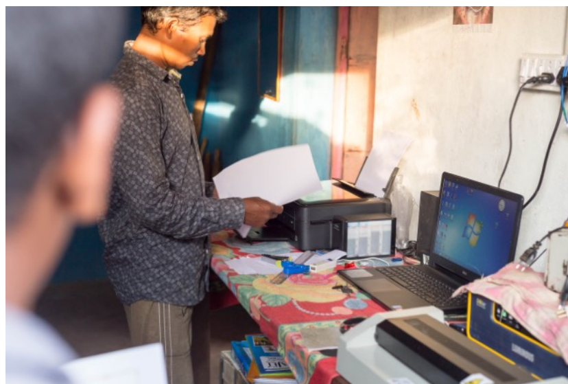
Solar Powered Digital Service Centres or Lok Sewa Kendras in Kalahandi, Odisha. These pictures were taken before the COVID19 Lockdown was enforced by the Government of India.