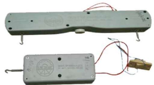
Above: Unit manufactured by Kerala State Coir Machinery Manufacturing Company (KSCMMC) based on CCRI guidelines. KSCMMC's electronic ratt, consisting of a double-spindle part (top), a single-spindle part (bottom-left), and overhead switches (bottom right)