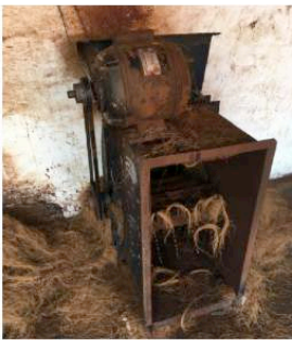
Top: Spinning Machine, Left: De-Husking Machine

The site has three automated spinning machines – one was demonstrated to us. They run from 1-5pm, in accordance with the power availability. There is no generator or power backup option. The machines were purchased three years ago – at a cost of Rs 1 lakh each – with a loan provided by SKDRDP, a local banking correspondent NGO. They each have a 1.5kW single-phase motor.