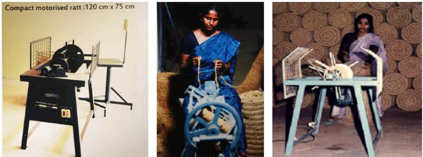
Compact motorized ratt, developed in 1992 (left and middle), standing version (right)

The museum explained the history of the coir industry, including machinery used to manufacture coir products, and also showcased some novel coir products. The motorised ratt was one of the items on display. It appeared to be a good solution because it is compact, uses a small motor (compared to automated spinning machine), and permits the user to sit during its operation. The machine was not successful in the field. This is because the productivity was lower (compared to traditional process), and the design was prone to mechanical failures.